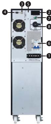
Titan Vista Neo P 6K/10K (Back View)